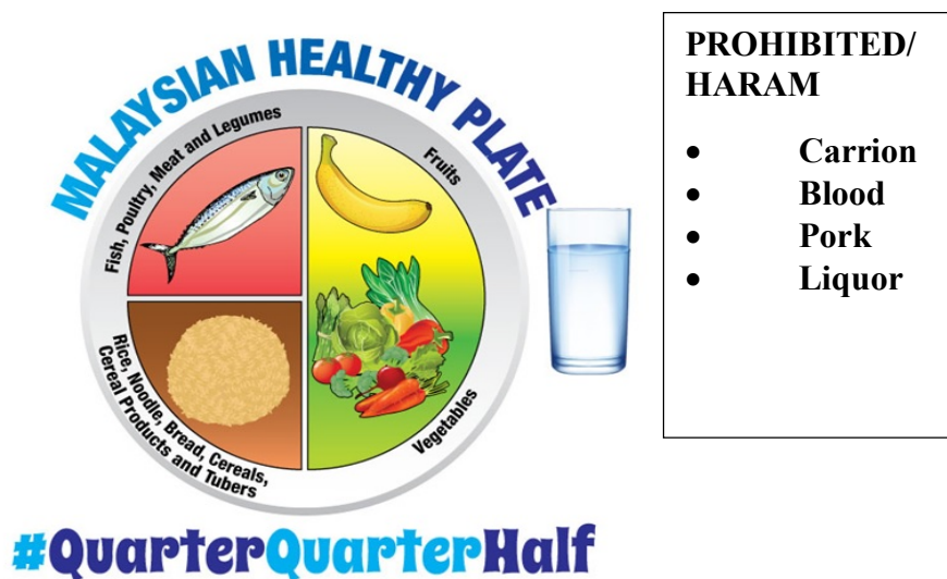
Fig. 2. Halal Nutrition Model

Table 1 shows that 11 out of 14 or 79% of the Key Messages of the MDG are in line with the Prophet’s diet. In view of the key elements of the Malaysian Healthy Plate is balance and moderation which is similar to the food of the Prophet Muhammad s.a.w., so it is proposed that the Halal Nutrition Model (Figure 2) is based on the Malaysian Healthy Plate with exceptions of carrion, blood, pork and liquor.